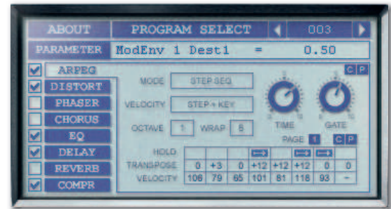
▲The faux LCD display in the centre of the GUI houses the effects settings

The step sequencer makes up for the inability to import MIDI files as arpeggiator patterns, while a bunch of more traditional arpeggiator modes are available too, if you prefer.