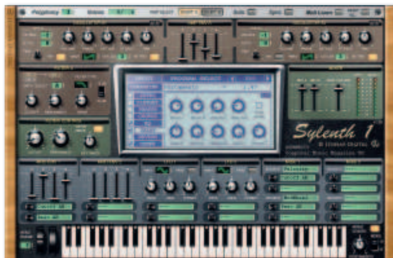
▲The colour of the oscillator sections and other relevant parts change colour when you switch Parts

Sylenth1 is absolutely recommended to anyone who uses a lot of bread and butter sounds from virtual analogue synths. It sounds better than 99% of the competition and, to our ears, it even rivals Access's famous Virus. While Sylenth1 doesn't quite have the lush sound of that instrument, on the whole it compares very well – amazing when you consider how little CPU power it requires. In a word: fantastic. cm